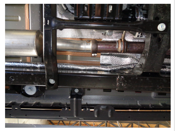
Step 1. Begin removal of the OEM exhaust system by loosening the clamp attaching the exhaust to the catalytic converter.